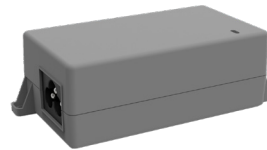
Gigabit PoE Injector (24 V)