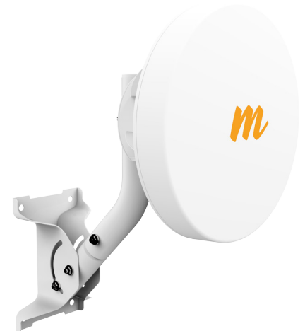
C5 with Mount